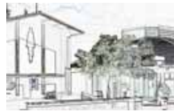
PHOTO DIRECTORY MAKE YOUR APPT. TODAY!

It is easy to sign up online: www.signup.olanmills.com and enter 925-837-5525 as our "Church Number." Or sign up by phone 800-866-2263, or in person at The Hut. There is no need to buy photos, but if you have your photo taken, you receive a FREE photo directory, and FREE 8 x 10 photo. Do you need a family photo for your Christmas cards? This is a great opportunity. Make your appointment early!