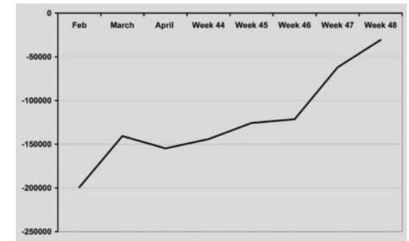
Contribution Shortfall through 5/29/11

Please continue to support our Ministries generously. In the Scriptures we are reminded that generous giving began in the Heart of God. It is at the very core of the effort God made to redeem mankind through the work of Jesus at the Cross. Thank you for responding to our prayers. As we make progress in reducing the operating shortfall, we continue to pray for your generosity. With only four weeks remaining we are $30,000 behind our ministry support plan. You can make a difference by contributing as God leads you in support of the wonderful ministries here at CPC. Our summer programs for our youth are being financed and we need your help. Please pray that we will have the resources to meet our plan. Thank you Lord for all we have.